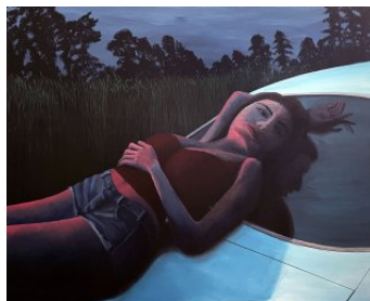
JAKE WATLING Have You Ever Felt a Southern Night, 2023 Acrylic 60 x 48 x 1.5 in (h x w x d) £ 5,000