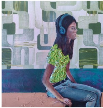
MENNATO TEDESCO Audio Loop, 2023 Acrylic and oil 80 x 80 x 2 cm (h x w x d) € 800