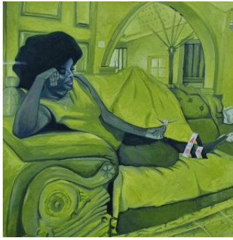
DAMILOLA AJEGBOMOOGUN The Player, 2023 Oil on Canvas 133 x 133 cm (h x w) $ 400