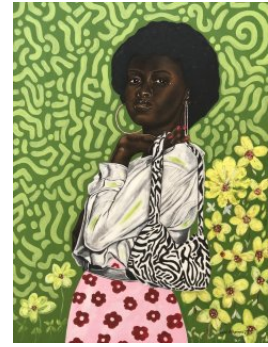
OLUWAFEMI AKANMU For a moment, 2023

Acrylic and mixed media on canvas 48 x 37 x 2 in (h x w x d) NGN 500,000