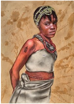
MARK DUKE Adanne, 2023 ink, acrylic and coffee 14 x 20 x 0.8 in (h x w x d) $ 400