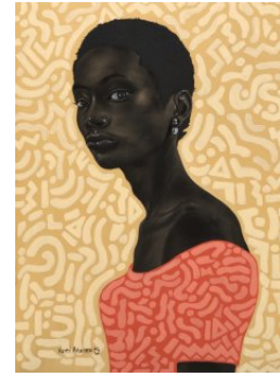
OLUWAFEMI AKANMU Unique (African allure) 4, 2023 Acrylic and Charcoal 81.3 x 61 x 2.5 cm (h x w x d) $ 2,500