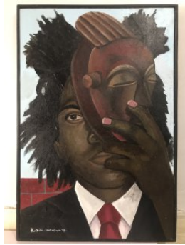
TOCHUKWU HENRY KANDUDI Untitled, 2024 Acrylic 24 x 36 in (h x w) $ 5,000