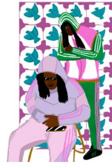
BUBACAR DJALO Good Boys screen print on paper 21 x 29.7 cm (h x w)