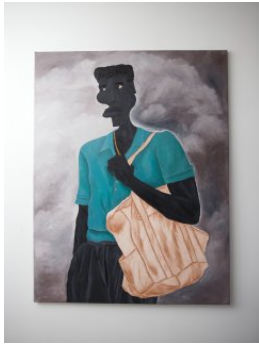
PAUL AMUSA The Journey, 2024 Oil on Canvas 100 x 130 cm (h x w) $ 1,600