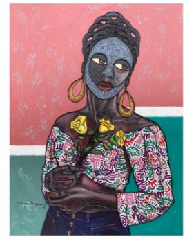
BENJAMIN OMOIKE Serenity (yellow Rose), 2022

ink, acrylic and coffee on paper 24 x 20 x 2 in (h x w x d) $ 800