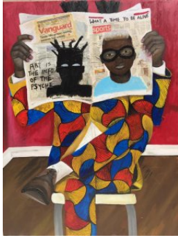
TOCHUKWU HENRY KANDUDI Untitled, 2024 Acrylic and newspaper on canvas 48 x 72 x 2 in (h x w x d) $ 5,000