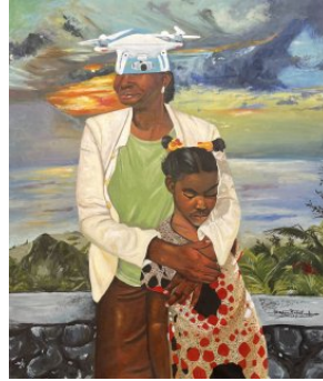
BABATUNDE GBADEBO Stay with me forever mum, 2024 Acrylic 30 x 42 x 1.7 in (h x w x d) $ 750