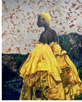
HATUNGIMANA ELIE Angel Numbers, 2024 Acrylic 100 x 80 x 4 cm (h x w x d) $ 1,550