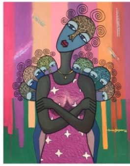
BENJAMIN OMOIKE Deep Conception, 2019

Oil on Canvas 112 x 121 x 2 cm (h x w x d) $ 300