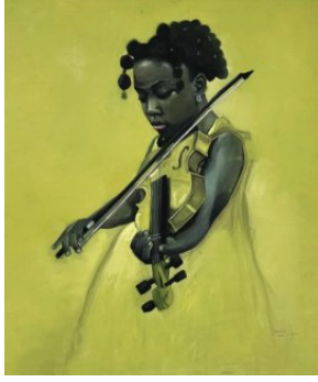
DAMILOLA AJEGBOMOGUN Yesterday Future, 2023

Oil on Canvas 112 x 121 x 2 cm (h x w x d) $ 300