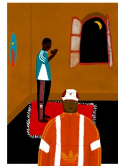
BUBACAR DJALO Prayer screen print on paper 21 x 29.7 x 1 cm (h x w x d)