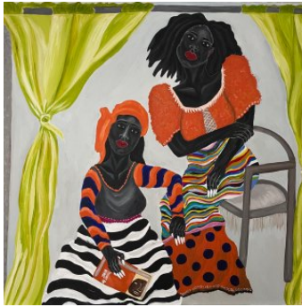
SOPHIA OSHODIN A Contemplation Of Some, 2023

Acrylic and Charcoal 24 x 48 in (h x w) $ 3,000