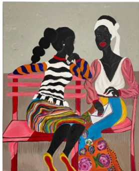
SOPHIA OSHODIN A Contemplation Of Some Sort II, 2024

Acrylic, ropes and fabric on canvas 48 x 37 x 2 in (h x w x d) NGN 600,000