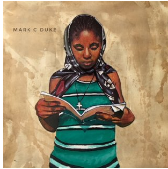
MARK DUKE Stories of the future, 2023

Acrylic 80 x 80 x 2 cm (h x w x d) £ 2,165