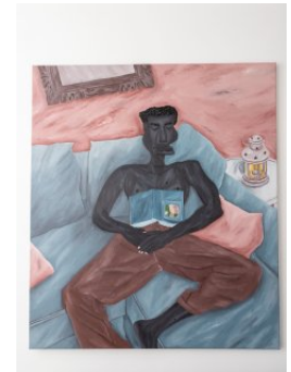
PAUL AMUSA Great Expectation, 2024

Acrylic 30 x 24 x 1.5 in (h x w x d) $ 2,500