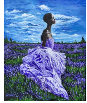
HATUNGIMANA ELIE Blooming in true self, 2023 Acrylic 100 x 79.8 x 4 cm (h x w x d) $ 1,800